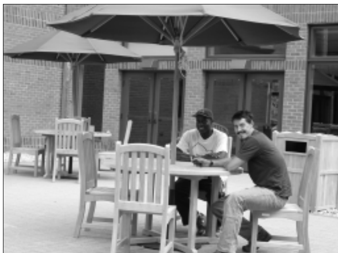
Enjoying the new Courtyard seating.