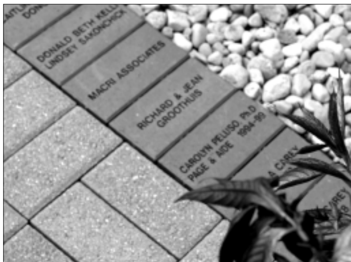
Commemorative bricks in place.