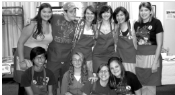
Last year's Nutmeg Book Buffet!

the library will be purchasing two iPads. These are for in-library use only. Stop by and test one out.